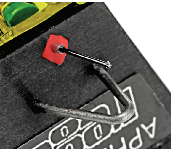
The boron rod cantilever carries a line contact stylus. Above is a guard. From above it can be seen clearly when cueing.

Of course, I had to spin The Big Band Sound, from the Syd Lawrence Orchestra - an extraordinary recording - and Sing Sing Sing showed