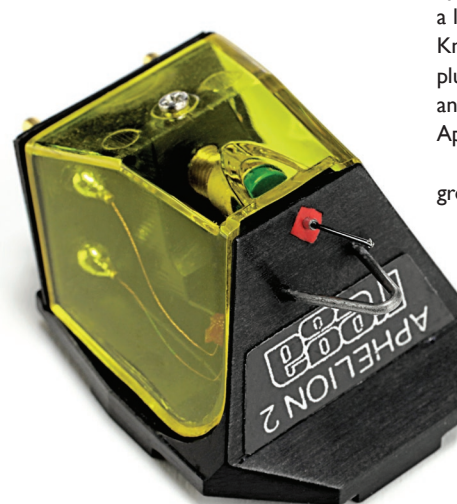
The body is compact in shape and light in weight - just 6gms.

Noise was more evident in a heavily played track, Out of Reach, from World of Blues Power (Decca, 1969) where the gloriously atmospheric vocals of Peter Green and his beautiful guitar work - second after Hendrix in my view - came over clearly, regular groove noise from heavy playing not being made intrusive. RIP Peter Green.