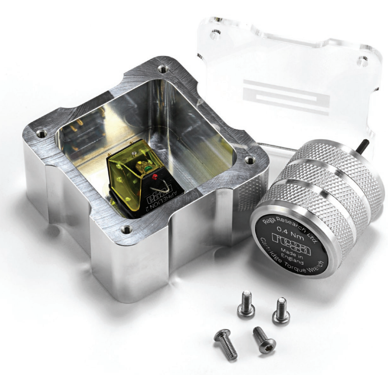
Aphelion 2 comes in a sturdy machined alloy case, complete with torque wrench to ensure the attachment screws are tightened by the correct amount.

"we are talking about cutting edge speed in the sound, or put another way excellent time domain definition"