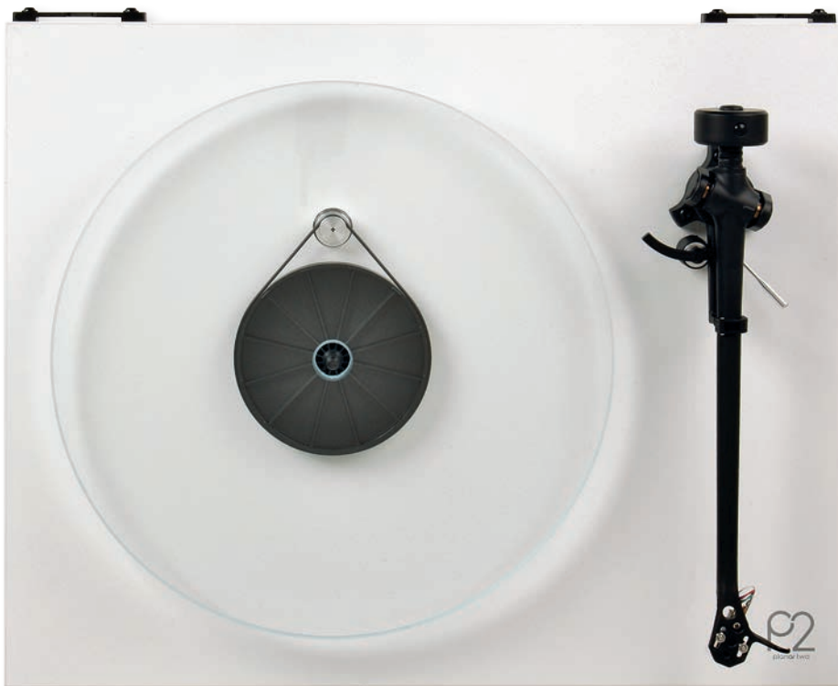
RIGHT: The Planar 2's acrylic-laminated plinth hosts an AC motor mounted at 12 o'clock under a glass platter. Its RB220 tonearm comes fitted with a Rega Carbon MM pick-up

As ever, you change the speed by moving the belt on the pulley even though this means you have to remove the platter. The main bearing is a new 11mm self-securing brass affair, which is said to offer lower friction and a tighter manufacturing