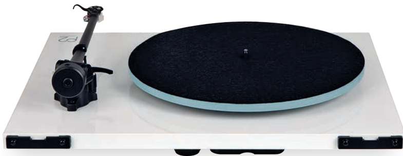
ABOVE: Rega's AC motor is driven by a wall-plug 24V power supply. A fixed pair of phono (RCA) cables exit from the base of the latest RB220 tonearm

of Nu Era's 'Lines Between Us' [from Geometricks EP ; Omniverse OMNI1201] showed me that little has changed in terms of the Planar 2's overall balance. The latest deck to carry the name remains smooth but a little dry – it certainly doesn't offer any extra coloration to sweeten the musical pill, and this might disappoint some analogue addicts. Bass is a little light in absolute terms, too, although certainly no worse than price rivals.